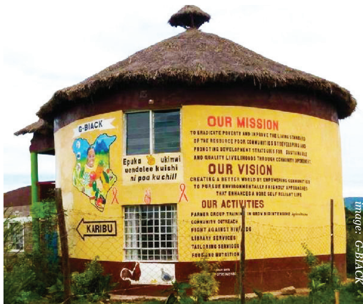
The GROW BIOINTENSIVE Agriculture Centre of Kenya