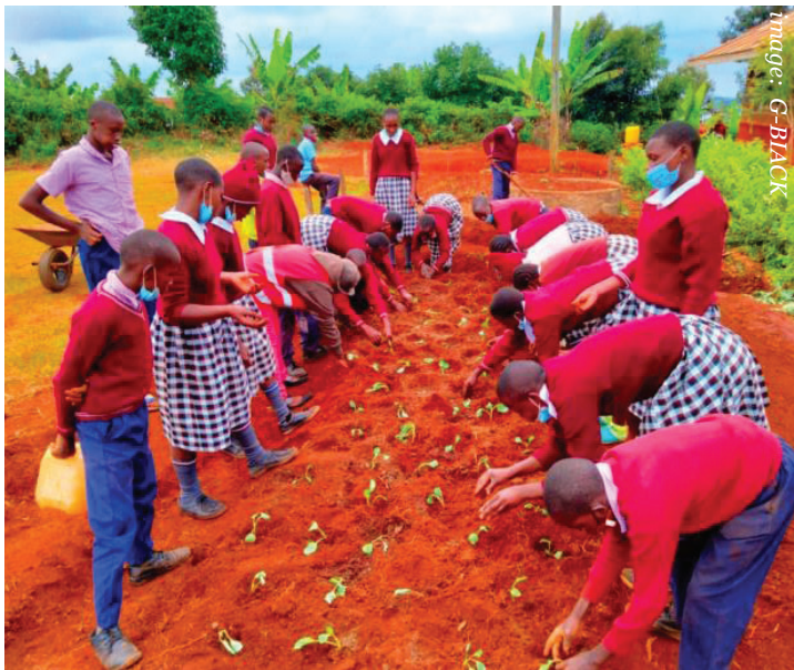
Kanjuku Primary School students learning GROW BIOINTENSIVE farming, 2021

Many of the students in the program participate in an NGO attachment program, spending three months working with an NGO, educating the staff to use and teach GB to others.