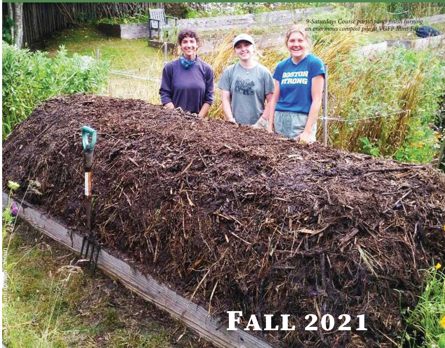
9-Saturdays Course participants finish turning an enormous compost pile at VGFP Mini-Farm

GROW BIOINTENSIVE® News from Around the World