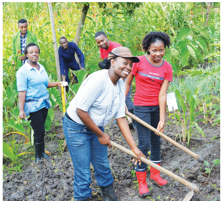
Participants in G-BIACK’s 2020 Youth in Agroecology Program learning GB

We are also asking that you, our global GROW BIOINTENSIVE Family, tell us about any organizations, foundations, or individuals who might be enlisted to support this very special project. G-BIACK is working hard to make our world better. Let’s get them the help they need, to help those who need it most! ●