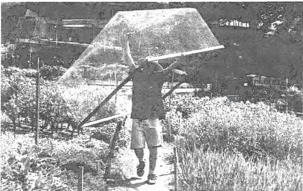
The new gopher cage about to be installed