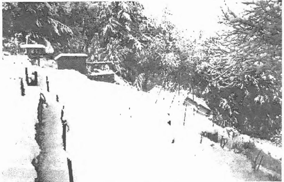
February snow on the Upper Knoll

Rutabaga is a less-common crop that we are quite fond of. We plant it in the spring for summer harvesting as well as in the summer for late fall and winter harvesting. It usually does well for us. Last year, we planted four sections in the spring, with yields at the rate of 123.6 to 185.4 lb per 100 sq ft, 1.8 to 2.7 times the U.S. average of 68.0 lb per 100 sq ft. The two sections planted in the summer produced at the rate of 102.0 to 129.4 lb per 100 sq ft, 1.5 to 1.9 times the U.S. average. The variety we are planting is Mary, originally